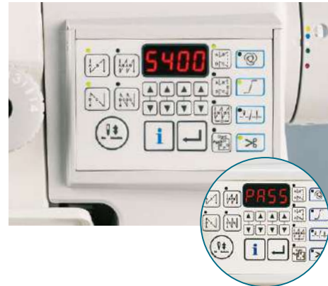
Provided with a password lock function

The control panel which belongs equivalently to the highly-functional CP-180 family is built into the control box. With this panel, various sewing data ranging from the sewing speed to the production support functions can be adjusted. In addition, the control panel has been newly provided with a password lock function to restrict panel operation. The machine may be used simply by entering any given passcode number.