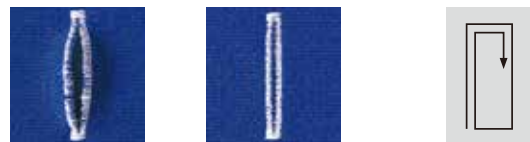
Without basting stitch With basting stitch Basting stitch (The state in which the material is stretched in the lengthwise direction after buttonholing)

Basting stitch : Since the needle thread is tucked in without fail, it will never jut out of the buttonhole seams. Basting stitch can be sewn by nine rounds.