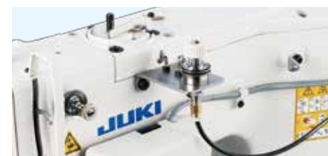
PART No. B0519-222-0B0*

The tension controller unit used to partially change the needle thread tension during the sewig of a pattern.