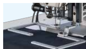
LK-1920(Pneumatic separately driven feeding frame)

*The monolithic type (magnet-driven) is provided with the manual pedal that allows the feeding frame to be lifted/lowered according to how the pedal is depressed.