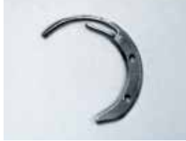
400-16408 Hook gib VS

Soft seams can be produced by lowering the bobbin thread tension.