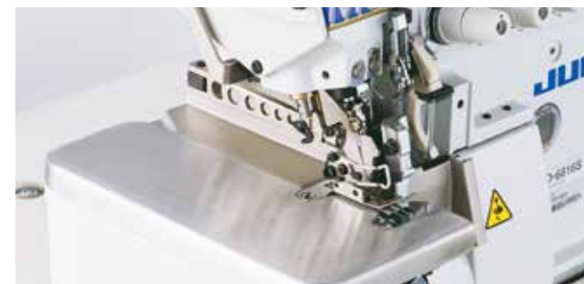
For runstitch / MO-6816S-FF6-30H