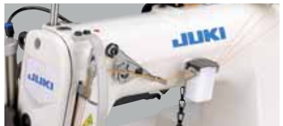
For MS-1261 series