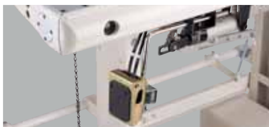
Knee switch type