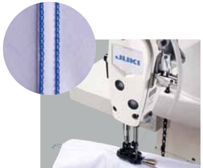
● Low-tension sewing ensures balloon stitches with a soft feeling.

The shape of the bed has been designed to allow the operator to handle it with ease. The push-button type stitch length dial has been introduced to change the feed amount. The timings of the feed driving cam and the looper rocking cam can be separately adjusted. All of these features are designed for easier operation and maintenance.